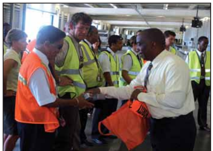
Tokens of appreciation