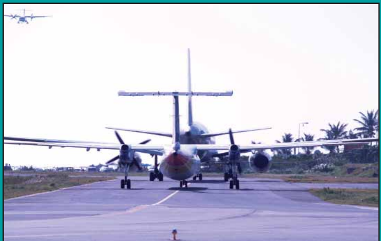
LIAT is ready to step in