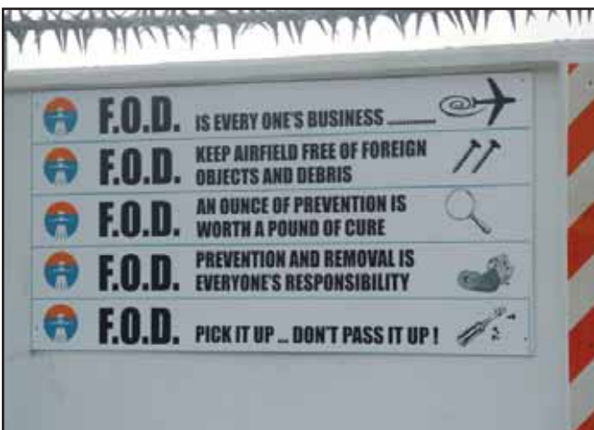
Instilling a new FOD culture

Participating workers were all presented with tokens of appreciation, made available by PJIAE and co-organizers Menzies Aviation and American Airlines.