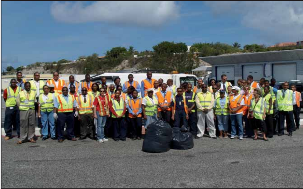
Workers who participated in the FOD activities