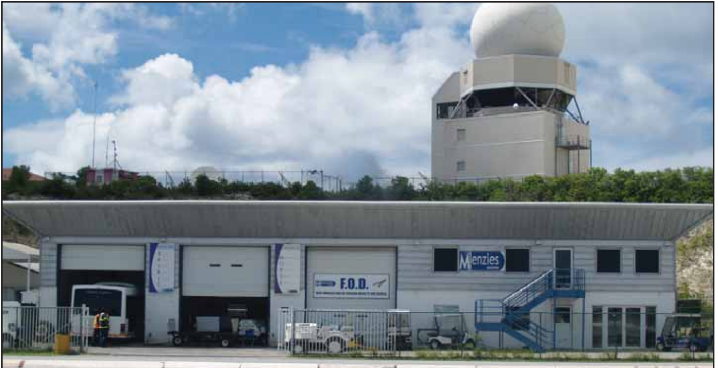
Menzies' headquarters in St. Maarten