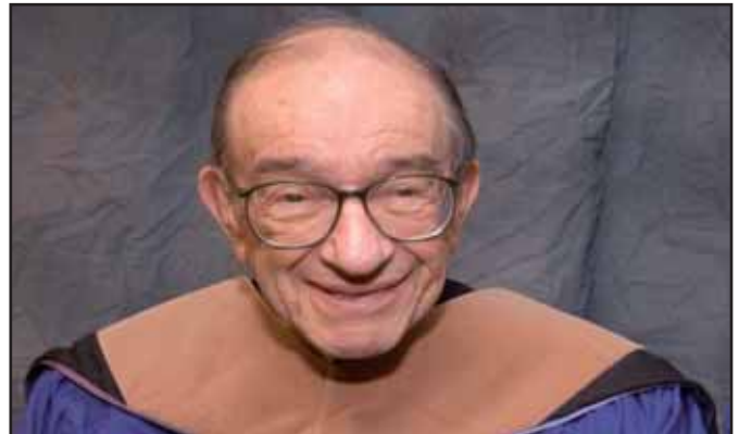
Dr. Alan Greenspan

The dim report, which was published by Business Travel Coalition and AirlineForecasters, implies that several large and small airlines will ultimately end up in bankruptcy and,