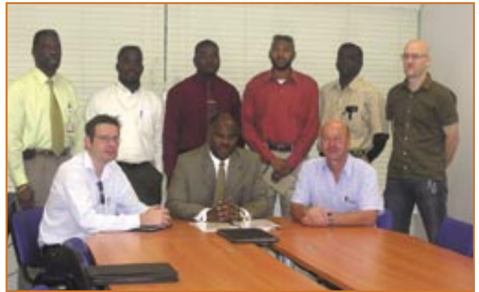
Representatives of the bidding companies with PJIAE officials.

RESAs are located at the runway extremity and are primarily intended to reduce the risk of damage to an airplane under-shooting or overrunning the runway. Due to the construction of these RESAs and the requirement to maintain the existing runway length for takeoffs and landings it became necessary to extend the runway by 120 meters to the east. The landing threshold at runway 10 (western runway end) and its associated marking and lighting will also have to be shifted accordingly.