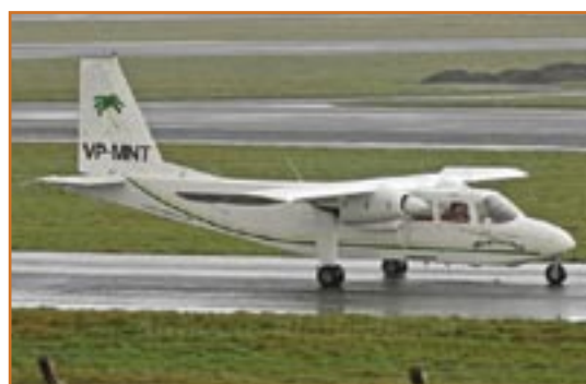
A FlyMontserrat aircraft in take-off.