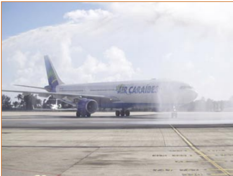
The customary water welcome

world economy, environmental concerns, and offer people in all islands the opportunity to fly and at cheaper prices. "Good pricing only happens when there is good competition, and that benefits everybody. But no competition has the opposite effect. I do believe with more airlines flying the Paris St. Maarten route prices will come down."