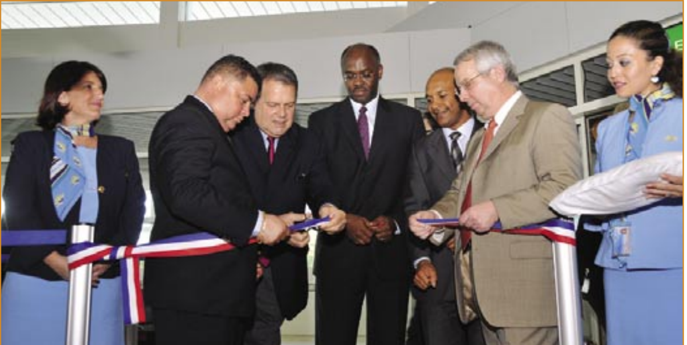
The official ribbon cutting

Air Caraïbes' inaugural transatlantic flight to St. Maarten on Saturday Dec. 12, was greeted with much fanfare at Princess Juliana Airport (PJIA) as airport officials, the two tourism offices, and Government dignitaries from both sides of the island laid on the full red carpet treatment.